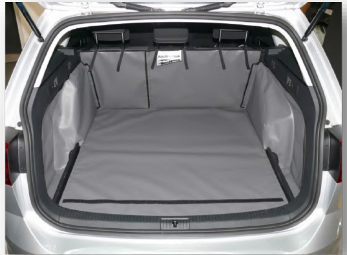
Photo: Rear Plus WITH Seat Split, prepared for additional Bumper Flap

Minimum of 18 Self-adhesive loop fastener tabs